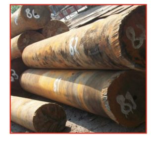
Shaft / Round