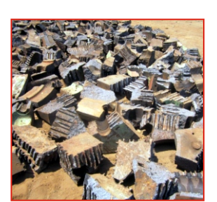
Cast Iron Scrap