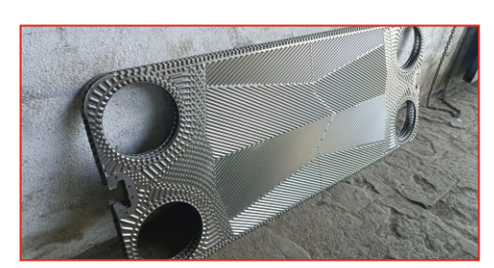
Titanium CP Sheets