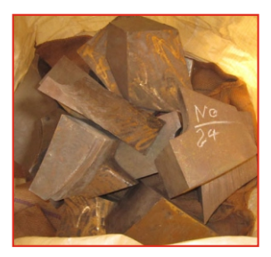
ALBC3 Propeller Scrap