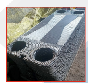
Titanium CP Sheets