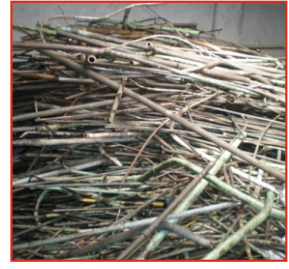
Cu - Ni Pipes