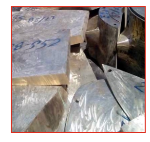
AB2 Propeller Scrap